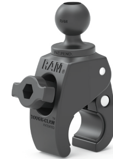
RAM-B-400U RAM® Tough-Claw™ Rail Base