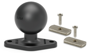
RAM-238-WCT Wheelchair Track Base