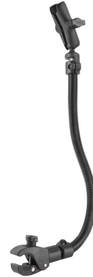
RAP-400-18-B-201 RAM® Tough-Claw™ with 26" Extension Arm