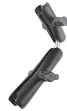
RAM-B-201-201U-C 10" Socket Arm for Arm Rests