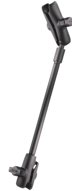
RAM-B-200-9-201 16" Pipe & Socket Arm for Seat Tracks