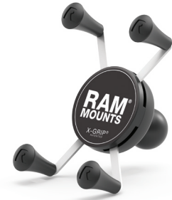
RAM-HOL-UN7BU RAM® X-Grip® Phone Holder