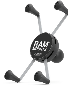
RAM-HOL-UN10BU RAM® X-Grip® Large Phone Holder