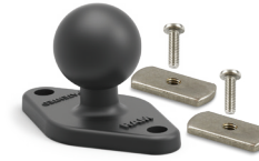
RAM-B-238-WCT Wheelchair Track Base