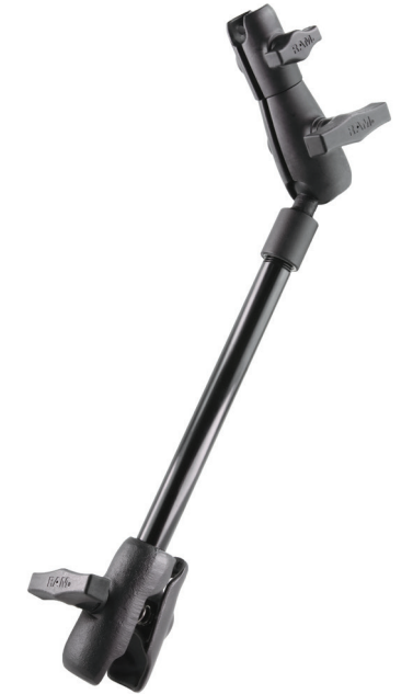
RAM-200-9-BC-201 19" Pipe & Socket Arm for Seat Tracks