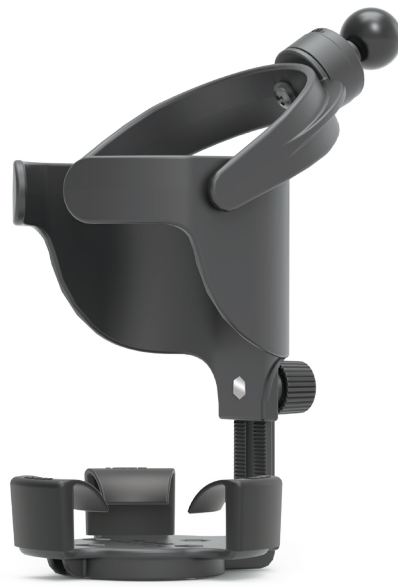
RAP-B-417BU RAM® Level-Cup™ XL 32oz Cup Holder