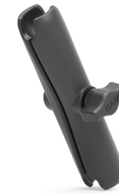
RAM-B-201U-C 6" Socket Arm for Arm Rests