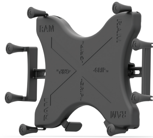
RAM-B-202-UN9U RAM® X-Grip® 9"-11" Tablet Holder For heavy-duty use only.